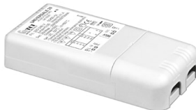
OPTIONAL Power supply Electrical

60.9379 Mains Dimming, continuous current power supply 10W, 220/240V - 50/60Hz