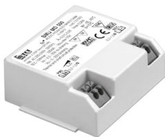
OPTIONAL Power supply Electrical

60.9692 30W, 220-240V - 50/60Hz Constant current power supply, with dip-switch programmable power supply current.