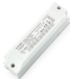
OPTIONAL Power supply Electrical

60.9592 Non dimmable continuous current power supply. 15-30W, 220/240V -50/60Hz with power current selected through adjustable switch. 350mA - 15W / 400mA - 17W / 450mA - 19W / 500mA - 22W / 550mA - 24W / 600mA - 26W / 650mA - 28W / 700mA - 30W.