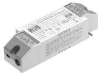
OPTIONAL Power supply Electrical

60.9408 No dim continuous current power supply 13-20W, 220/240V - 50/60Hz