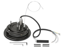
RF27613 Arrangements Recessed ceiling wall assembly