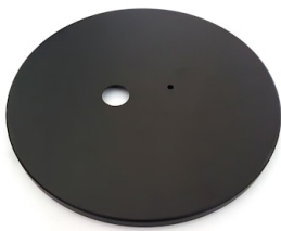
RF26773 Arrangements Recessed ceiling rose cover