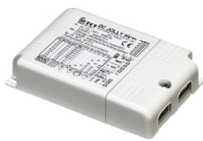
OPTIONAL Power supply

FA68 Power supply 10 x 1W/ 100÷265V - Iout 350mA (7x1W/110V) IP40 Class II Selv Eq.