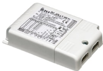
OPTIONAL Power supply

FA184 Power supply 16 x 1W/ 110÷240V - Iout 350mA (12x1W@110V) IP67 Class II Selv Dimmable Push-Dimm Or 1.10V