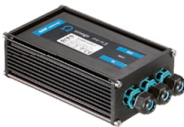
OPTIONAL Power supply

FA129 Power supply 16 x 1W/ 110÷240V - Iout 350mA (12x1W@110V) IP20 Class II Selv Eq. Dimmable Push-Dimm Or 1.10V