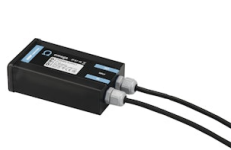
OPTIONAL Power supply

RF25752 Power supply 24Vdc 20W / 220-240V IP67 Class II selv. Non Dimmable