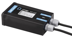
OPTIONAL Power supply

RF25752 Power supply 24Vdc 20W / 220-240V IP67 Class II selv. Non Dimmable