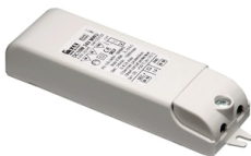
OPTIONAL Power supply

FA235 Power supply 8W/110÷240V - 24Vdc IP67 Class II selv. Eq.