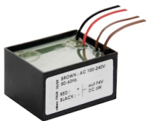
OPTIONAL Power supply

Power Supply dual function C.V. Vout 24Vdc 8W, Vin 220÷240V C.C. Iout 350mA: 8W, Vin 220÷240V IP 20 Class II Selv. NON Dimmable