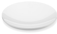
RF00780 Taccia Led Shiny white reflector