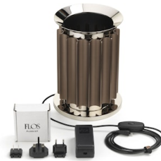
F6608046 Taccia led Anodized bronze base