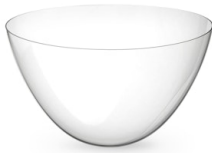
F6609000 Taccia LED transparent diffuser & reflector (PMMA)